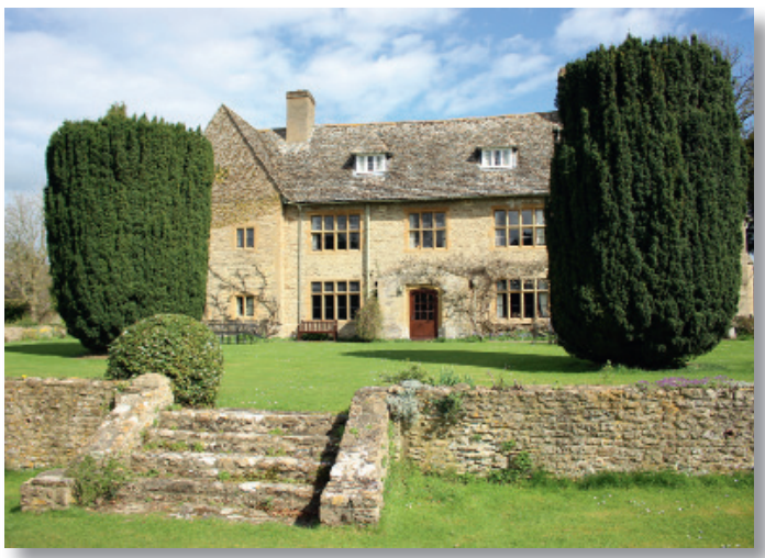
The price of the course does not include food and accommodation at Charney Manor (which is to be paid for separately).

A 4-day course in a room with ensuite, for single occupancy, and with meals, costs around £320 per person.