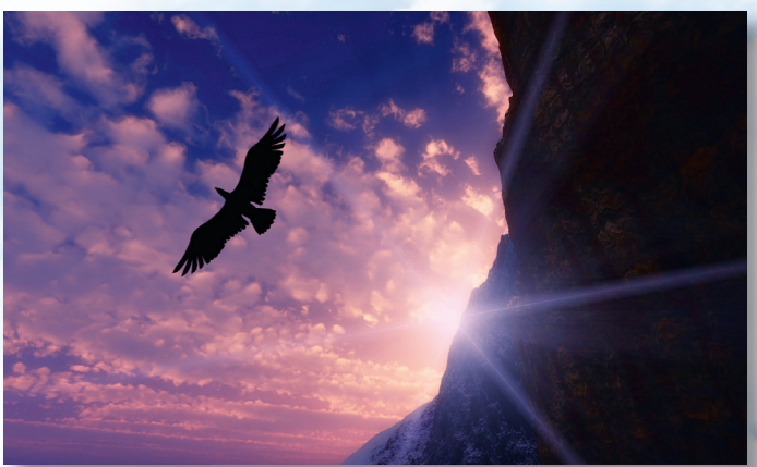
Part 3 Become a Certified Master Trainer in Energy Medicine, Mysticism & Shamanic Healing

Deepens your connection with Spirit and refines your healing skills, so you can work with assisting others in their healing journey and help them connect with their soul.