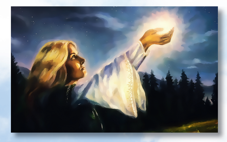
Part 2 Become a Certified Advanced EnergyMedicine Practitioner & Soul Coach

Deepens your connection with Spirit and refines your healing skills, so you can work with assisting others in their healing journey and help them connect with their soul.